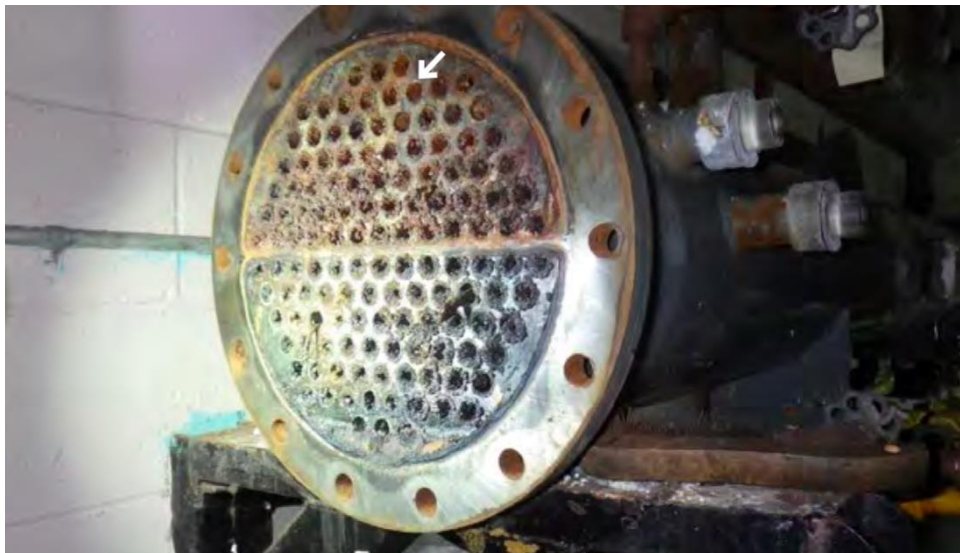
Figure 2: The heat exchanger had previously been reported to be leaking, and some of the tubes were blocked.

The ventilation in the machine room probably worked when the system was first started. But over the years, a section was removed, and the exhaust was no longer sent over the roof but could enter parts of the building resulting in a concentration of up to approximately 300 ppm in the entrance area.