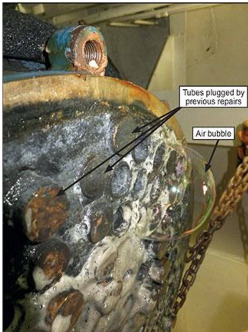
Figure 1: Some of the tubes had previously been leaking and blocked.

in the accident from an ice rink in Canada (Ferne Memorial Arena ice rink, also mentioned in this paper). The R-22 had travelled with the refrigerated seawater into the tanks. When three other crew members climbed down to their colleague, they quickly became dizzy and felt uncomfortable, so they abandoned the task and climbed back up. The O 2 level was measured to 6%, which is dangerously low.