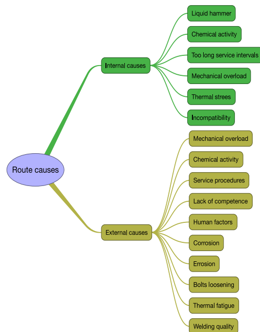
Figure 4 Route causes can be found both internally and externally

In many countries the certification of the individual certificate holder is only valid for a limited time e.g. 5 years, after which it can be renewed if the certificate holder can demonstrate that he has active participated in